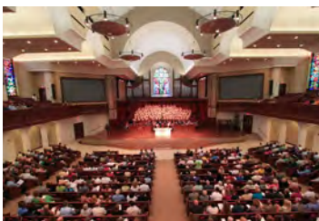
christ united methodist plano, tx