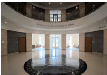
smu - school of engineering dallas, texas